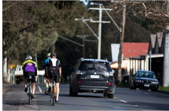
Under the new law, drivers and motorcyclists can briefly cross painted lines to give bike riders the space they need.